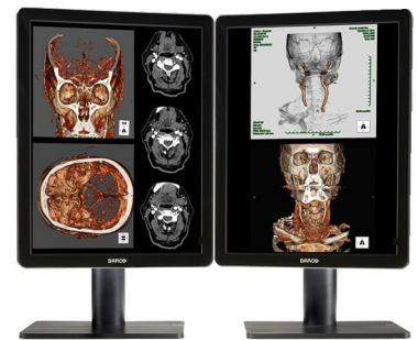
Dual displays - Side-by-side

For those who prefer running side-by-side comparisons, requiring minimal image manipulation with high brightness and contrast ratio for greater DICOM JNDs